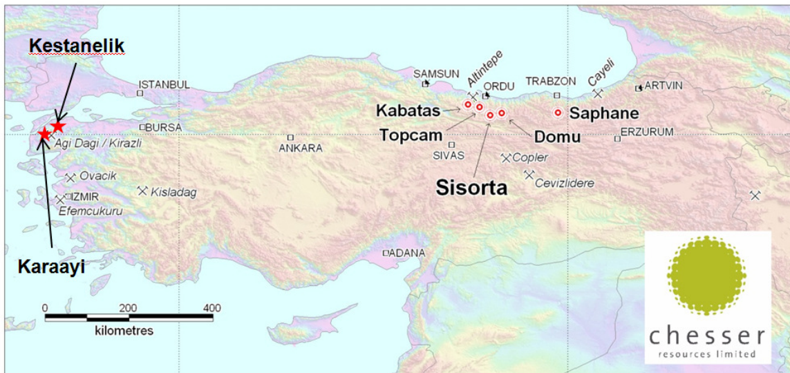
Figure 1. Shaded Topographic map of Turkey showing the location of Chesser's Turkish projects, along with the locations of a number of other significant Turkish mines and prospects